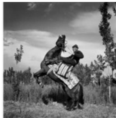
Aitor Lara, 'Tower of Silence'

Travel Photo Jaipur will showcase a specific kind of photography: travel photography. The launch edition will comprise of fourteen exhibitions from around the world, which will be displayed on large prints at some of the city's landmark locations, including the Hawa Mahal, Albert Hall Museum and Jawahar Kala Kendra, serving to highlight how sites of heritage can be used for contemporary artistic ends.