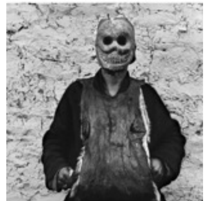
Serena Chopra 'Bhutan Diaries'

Serena Chopra has been travelling to Bhutan for more than twelve years, photographing a community as it experienced a shift towards modernity, while preserving its culture. She trekked with a special permit to remote and restricted areas in high altitude regions as there were no roads that led to these faraway villages and nomadic communities. Serena had an intimate experience of the lives of various villagers since she lived with them during her repeated visits. Over the years, Chopra has created an archive of human emotions observed while travelling through a country that has famously been defined as searching for "gross national happiness". In many images, a particular prominence is given to ceremonial masks, representing a variety of deities. The small size of Bhutanese masks that cover the wearer's faces only up to the nose, together with an absence of openings where the divinities' eyes are depicted, ensure that the sitter looks back at the photographer only from the openings in the mouth, thereby fracturing the gaze. This exploration of a land so faraway, yet so close has been catalogued with a discrete classicism that offers an evocative insight into the lives of the Bhutanese people. www.sepiaeye.com/serena-chopra