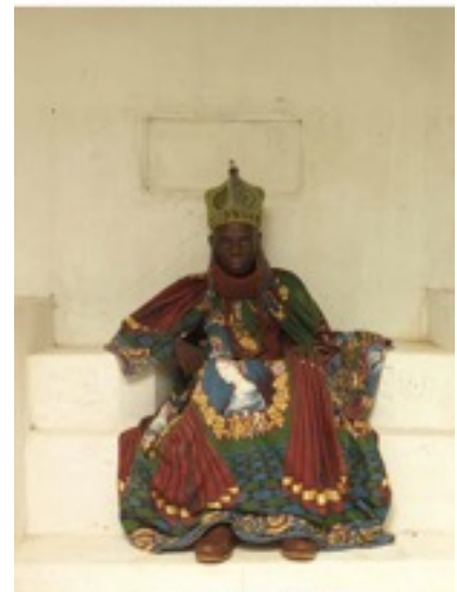
George Osodi, 'Nigeria Monarchs'

Pre-colonial Nigeria, boasted many kingdoms whose fate changed with the arrival of the British. In 1963, when Nigeria became a republic within the Commonwealth, the monarchy system was formally abolished. However, the royal families have remained relevant in the political landscape, often serving as intermediaries between their communities and politicians. They still command respect of their subjects and enjoy a godlike status. Beyond the striking personalities, the full regalia and sense of fashion offer an insight into a fascinating material culture. Through these images, we follow the photographer George Osodi's journey of discovery of his own country, and of Nigeria's monarchs who, albeit not holding any constitutional power, remain custodians of peace and an of important cultural heritage. Curated by Ziggi Golding. www.nigeriamonachs.com